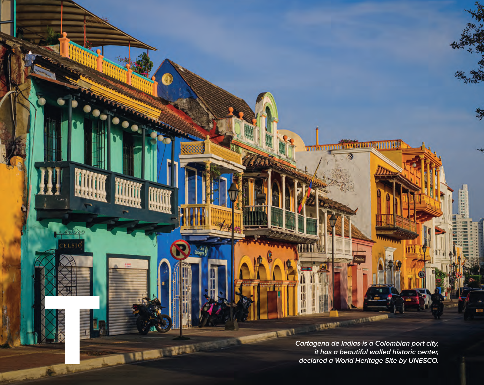
Cartagena de Indias is a Colombian port city, it has a beautiful walled historic center, declared a World Heritage Site by UNESCO.

The 2023 edition of the Finance in Common Summit (FiCS), hosted in Cartagena, Colombia, will gather Public Development Banks' (PDBs) representatives with their main partners, to showcase their irreplaceable role making finance more inclusive and more sustainable. This year's edition is co-hosted by the Inter-American Development Bank (IADB), the Latin American Association of Development Financing Institutions (ALIDE), and the Business Development Bank of Colombia (Bancóldex) with the support of the European Invest-